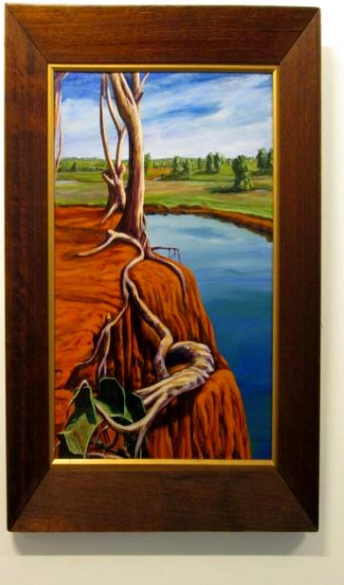
Jamie Richmond ' Irrigated ' Acrylic on board 2012