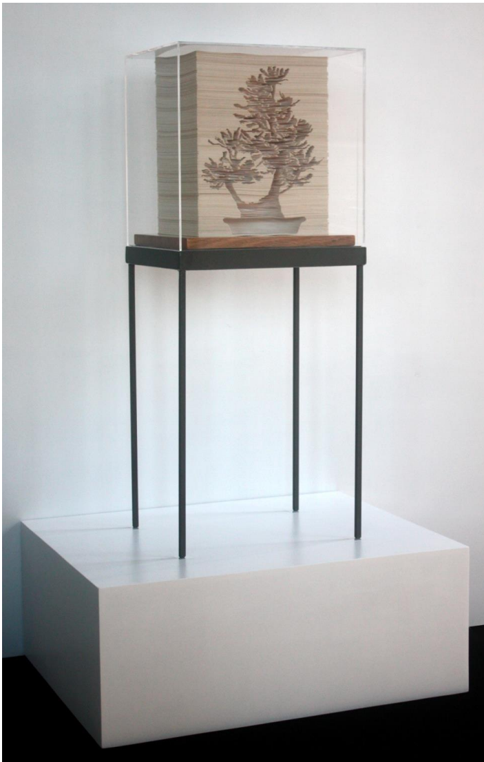
Image: Kylie Stillman Banksia Serrata, 2012 Courtesy of the artist and Utopia Art Sydney