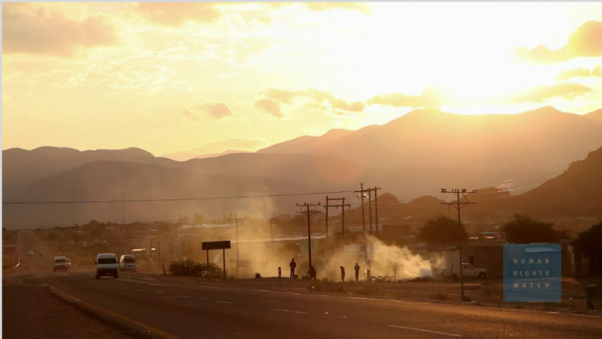
Still image from Difficult Love – by Zanele Muholi

Many people can make pictures and create images, sculptures and videos but not all of them are artists according to this definition. An artist in my view is someone for whom those outcomes are the end result of a whole process which is more akin to philosophy than to craft. Artists think and the work they make is the necessary expression of that thinking.