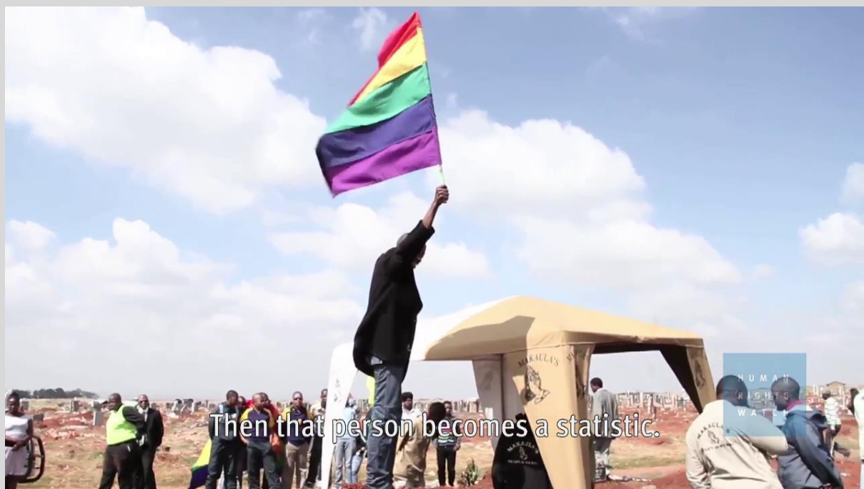
Still image from We live in Fear – by Zanele Muholi

audience experiences being with the artist and in doing so experiences themselves as present. Although completely different in purpose Zanele has the courage to place her life in the public domain in a way that she is at risk of being a victim of the very crime she is alerting the world to. Zanele allows us to enter this world through her story telling and imagery and by the trust she engenders from her friends who allow her to include them in her work.