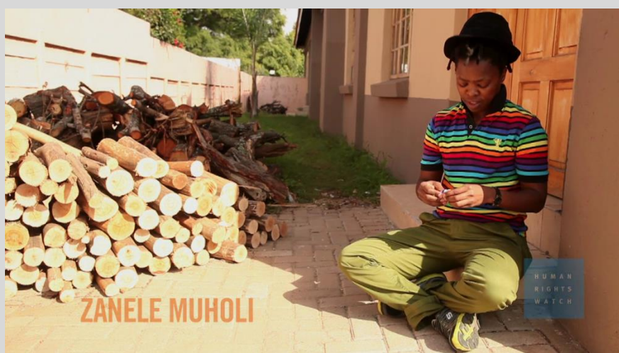
Still image from We live in Fear – by Zanele Muholi

Zanele Muholi is a great example of this. Her life is her art. She creates as a way to deal with the grief and trauma she encounters daily as a black lesbian in Sth Africa in the 21 st century.