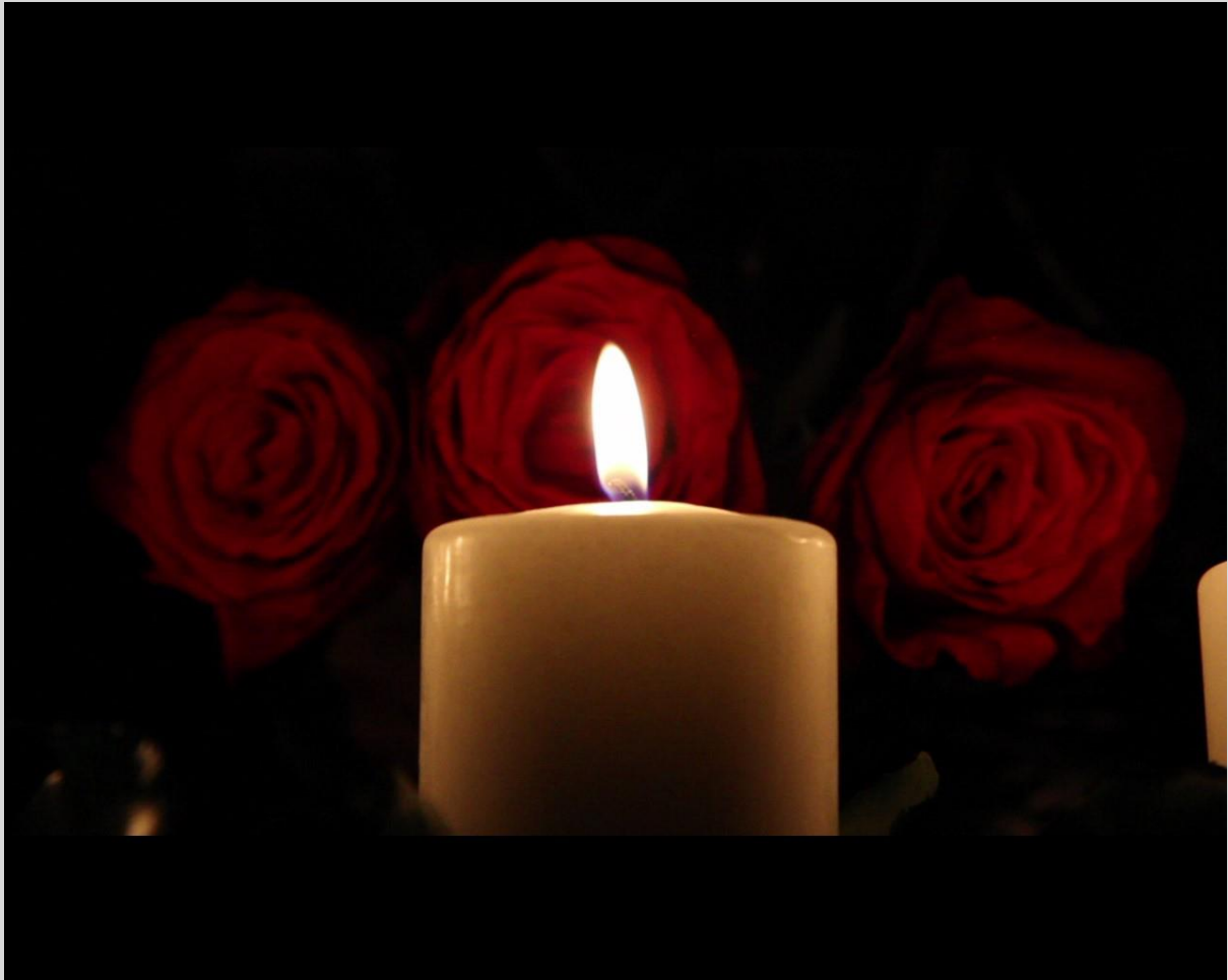
Still image from F(o)und – by Zanele Muholi

It is the responsibility of all of us to be aware of these issues and to share this awareness so that her work can reach more people and make the difference she wants it to make.