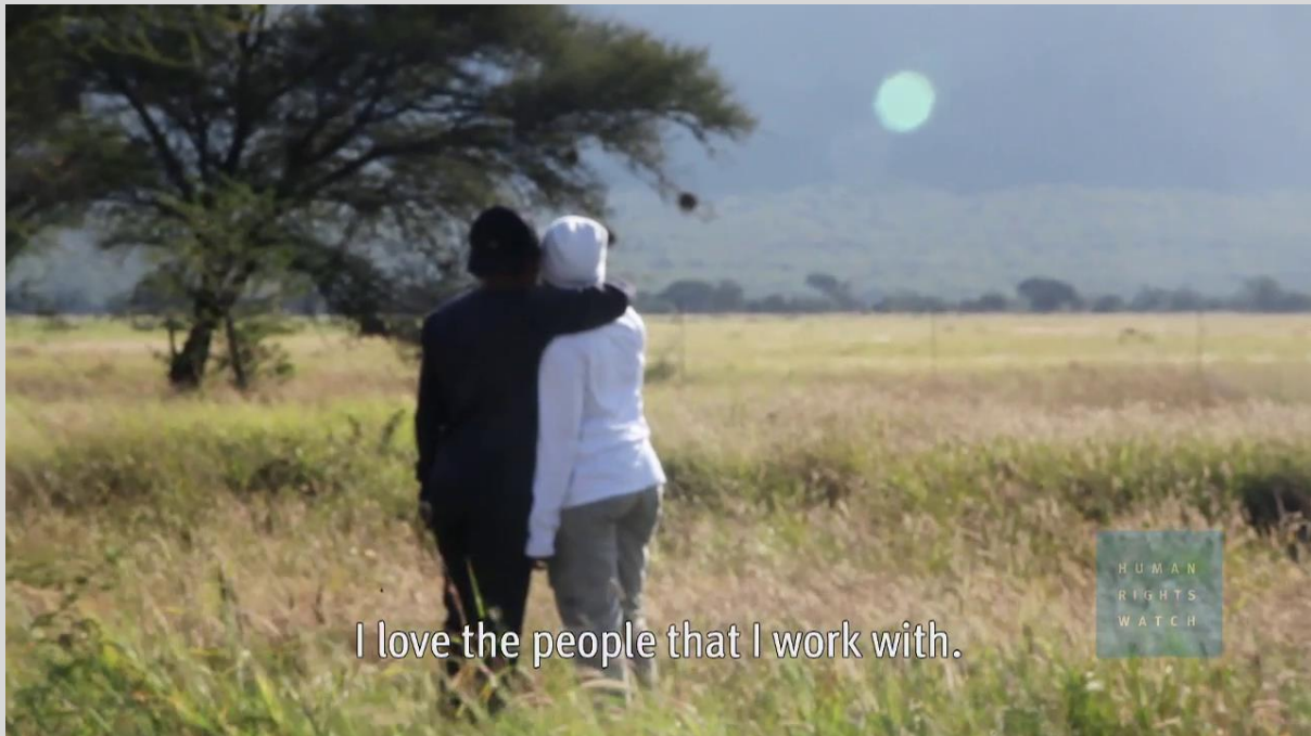
Still image from We live in Fear – by Zanele Muholi

I would ask us all to consider that while violence is committed towards people based on their sexual orientation it is all of our responsibility to stand up against it wherever we are.